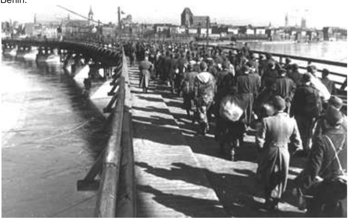
U.S. Third Army units reached the border between Germany and Luxembourg. January 30, 1945

Auschwitz/Birkenau death camp was liberated by the Russian armed forces. Only 2819 inmates were there to be liberated. Red Army units reached a point 120 miles from Berlin.